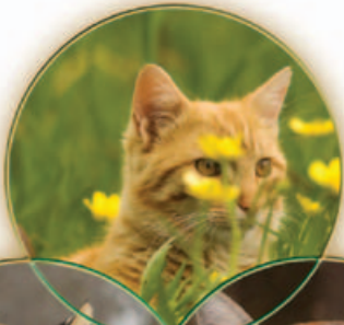
Pet and stray cats

Only cats and other members of the cat family shed Toxoplasma in their feces. Cats may shed the parasite in their feces for 7-21 days the first time they get infected with Toxoplasma . If they are allowed outside, pet cats can get infected when they catch and eat wild animals. Toxoplasma can be found in the feces of cats below: